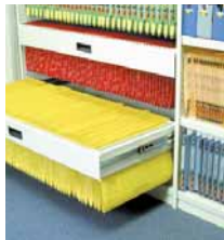
Pull out cradles