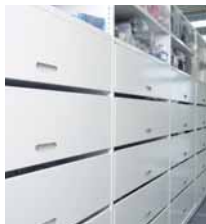
Pull out drawers