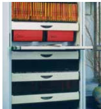
Pull out shelves