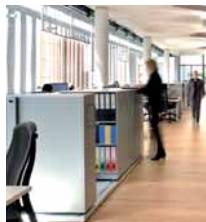
LOW LEVEL MOBILE STORAGE