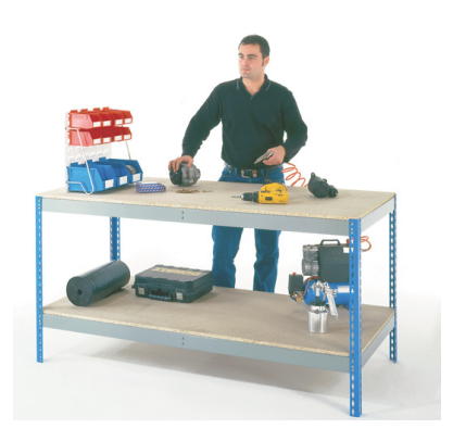
Ledge Unit Benches