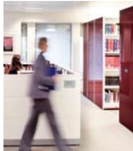
■ OFFICE STORAGE