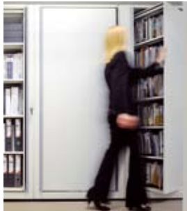
■ ROTARY STORAGE