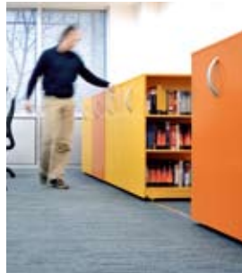
■ LOW LEVEL MOBILE STORAGE