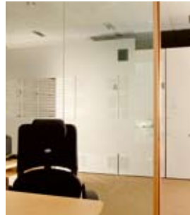
■ MOBILE STORAGE