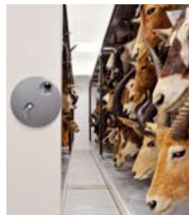
■ MUSEUM & HERITAGE