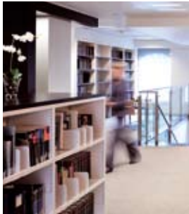
■ STATIC SHELVING