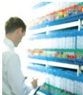
■ FILING SERVICES