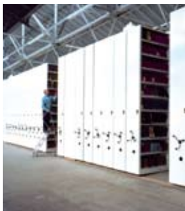
■ ARCHIVE STORAGE