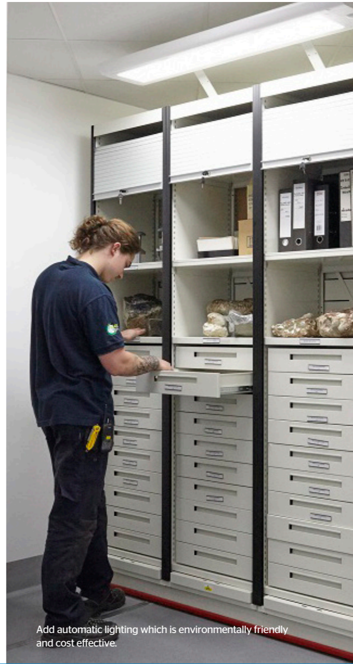
Add automatic lighting which is environmentally friendly and cost effective.